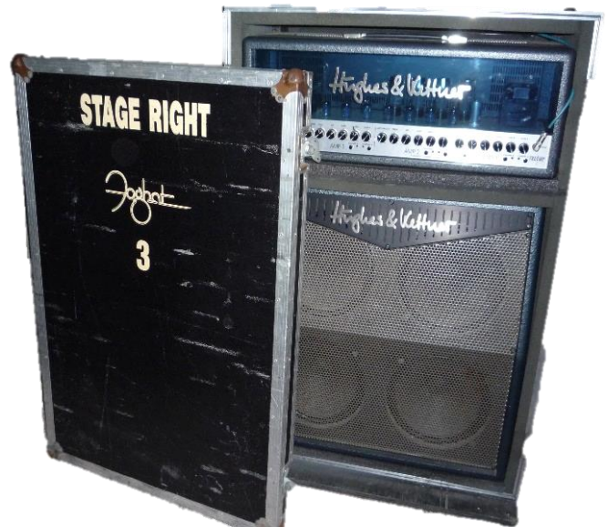
The Foghat Lonesome Dave Rig