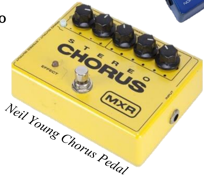
Neil Young Chorus Pedal